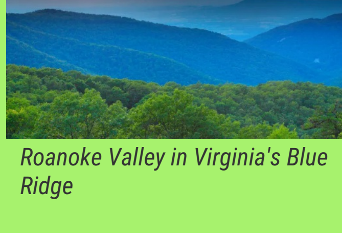
Roanoke Valley in Virginia's Blue Ridge