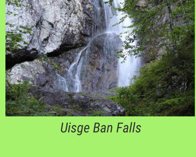
Uisge Ban Falls