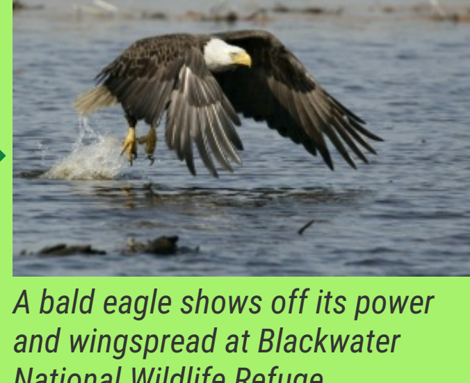
A bald eagle shows off its power and wingspread at Blackwater National Wildlife Refuge.

Trip Length: Roughly 110 miles, plus side strips