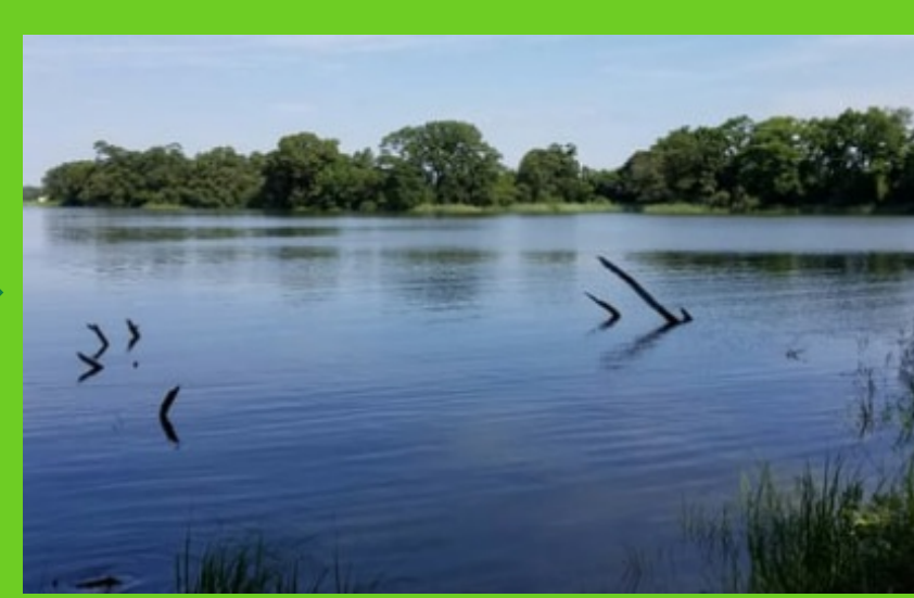
Wye Island Natural Resources Management Area