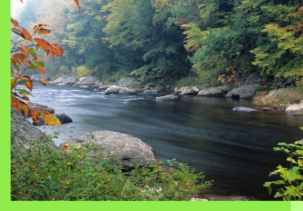
Jamaica State Park