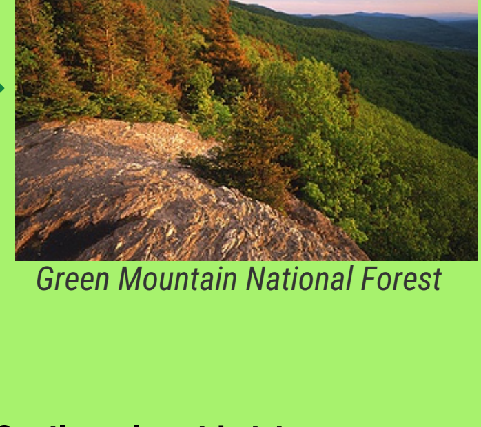
Green Mountain National Forest