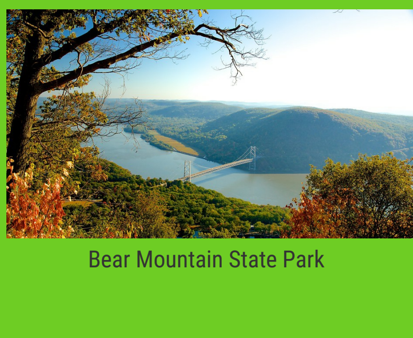
Bear Mountain State Park