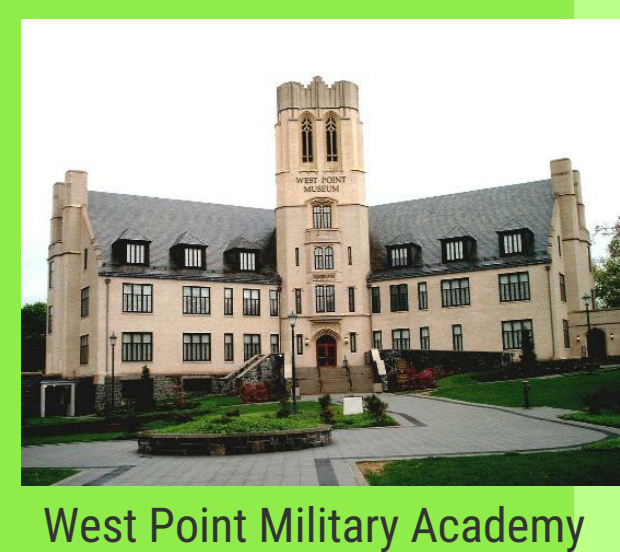
West Point Military Academy Museum

With the construction of the Palisades Interstate Parkway in the 1950s, Route 9W was shifted to the west. Part of the 1926 highway is still used as the entrance road to the Lookout from the Parkway; north of the Lookout, the old highway is now closed to traffic and enjoyed by pedestrians and cyclists.