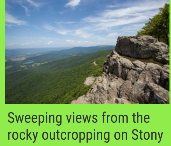
Sweeping views from the rocky outcropping on Stony Man Overlook.