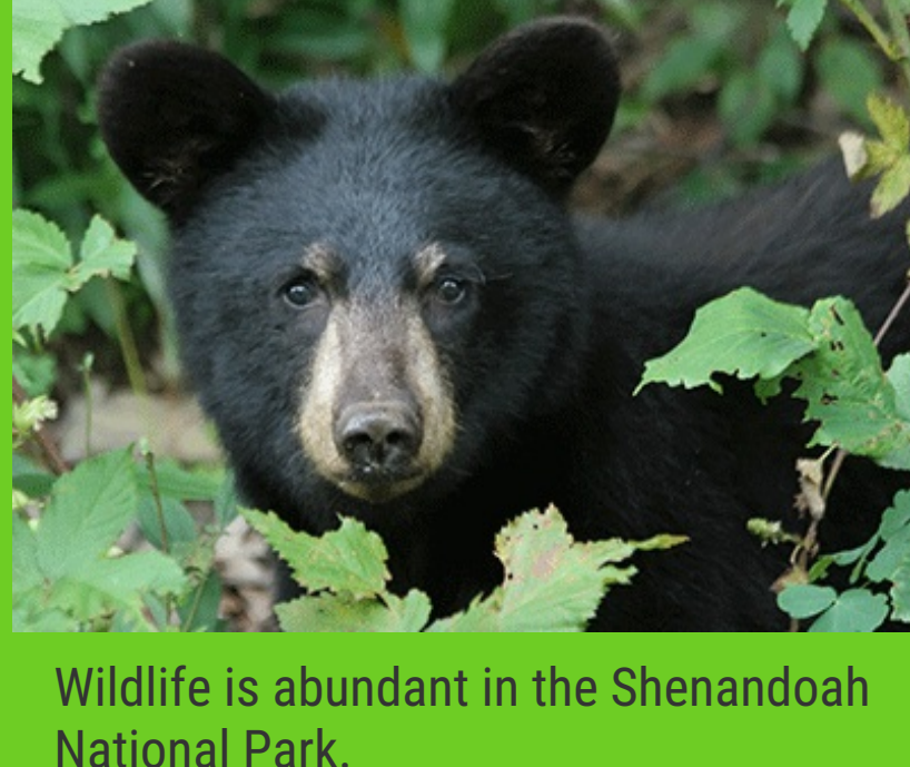
Wildlife is abundant in the Shenandoah National Park.