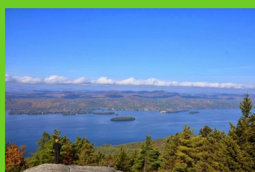
Prospect Mountain Overlooking Lake George.