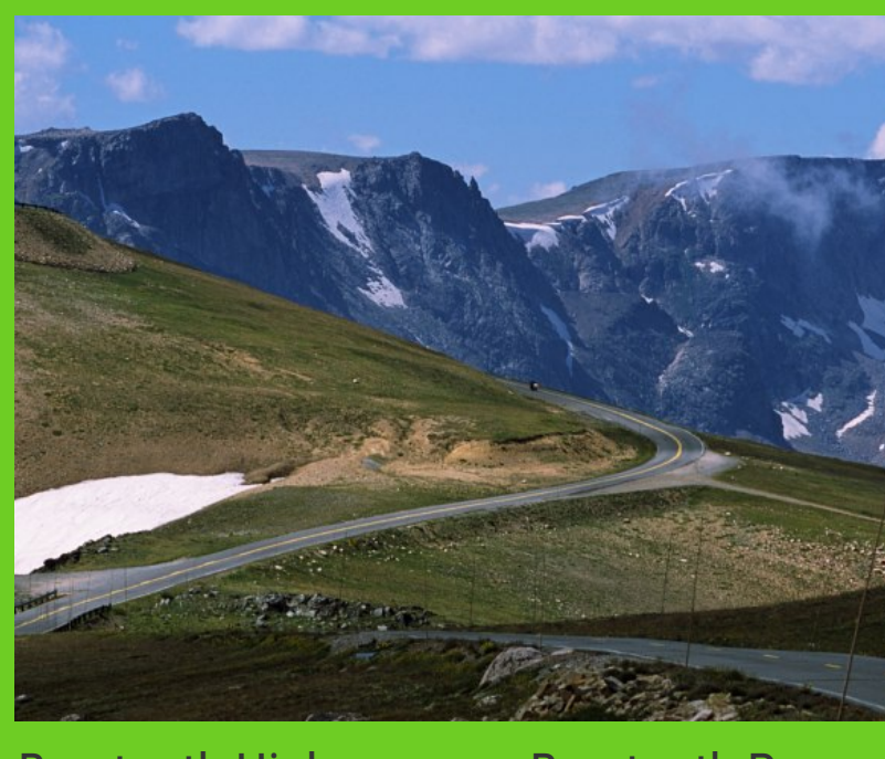
Beartooth Highway near Beartooth Pass.