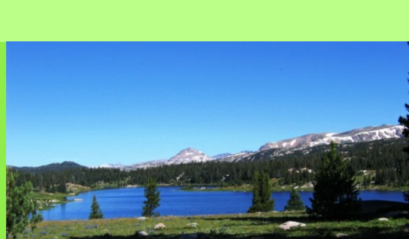
Beartooth Lake Montana

The most famous of the Beartooth Highway's adjoining scenic byways is the historic Chief Joseph Scenic Byway. Designated by Wyoming as a state byway in 2000, the Chief Joseph followed as he and his band of followers fled toward the Canadian border.