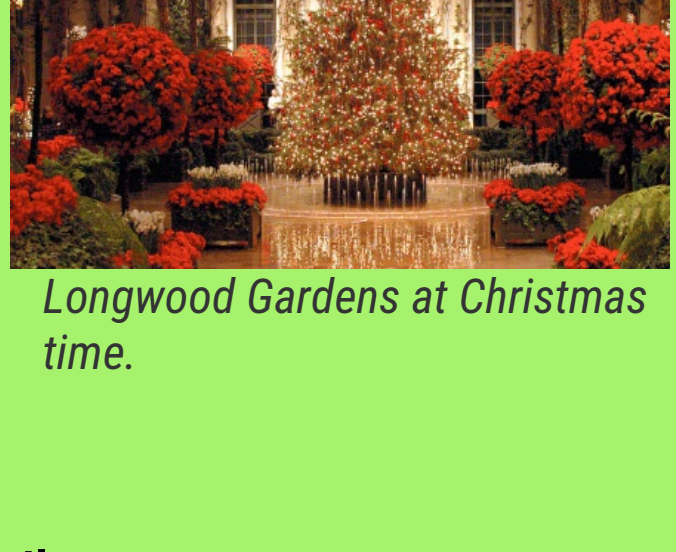
Longwood Gardens at Christmas time.