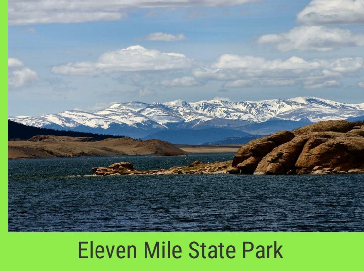
Eleven Mile State Park