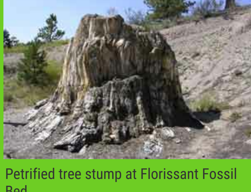
Petrified tree stump at Florissant Fossil Bed.