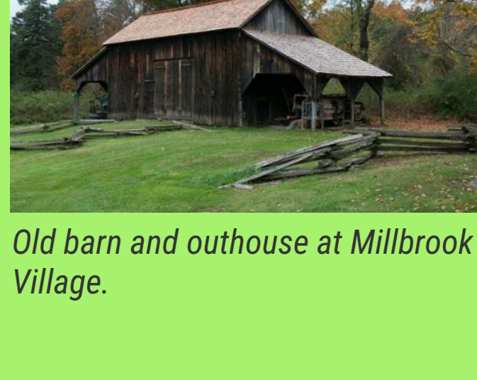
Old barn and outhouse at Millbrook Village.

Trip Length: Roughly 85 miles, plus side strips