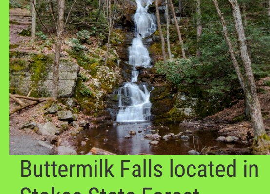
Buttermilk Falls located in Stokes State Forest.

+ The Delaware River offers some of the finest and most accessible recreational opportunities in the northeastern United States. Popular activities include boating, fishing, swimming, camping, hunting, hiking, bird watching, sightseeing along state-designated scenic highways, and cycling along canal towpaths.