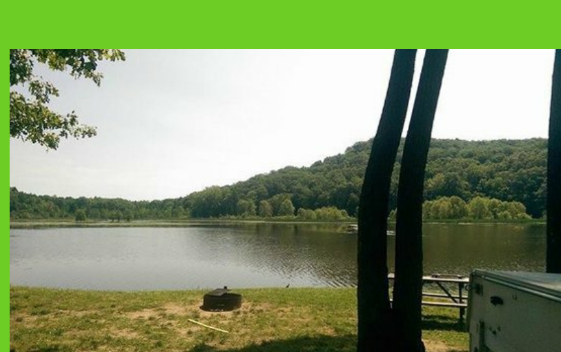
Starve Hollow State Recreation Area