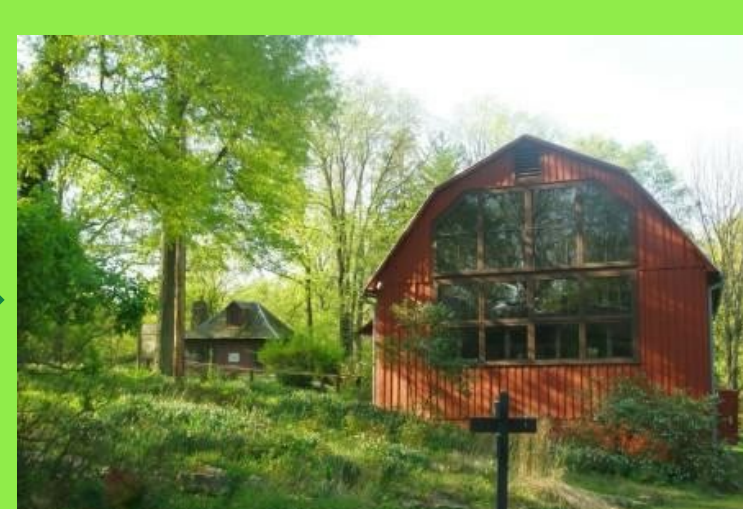
TC Steele State Historic Site

When Indiana became a state in 1816, Corydon was made its first capital. Here the constitutional convention drew up a blueprint for government in the limestone capitol, which still stands near the town square. Nearby are the 1817 Thomas Posey House and the oldest building in Corydon, the 1800 Branham Tavern, which is constructed of logs.