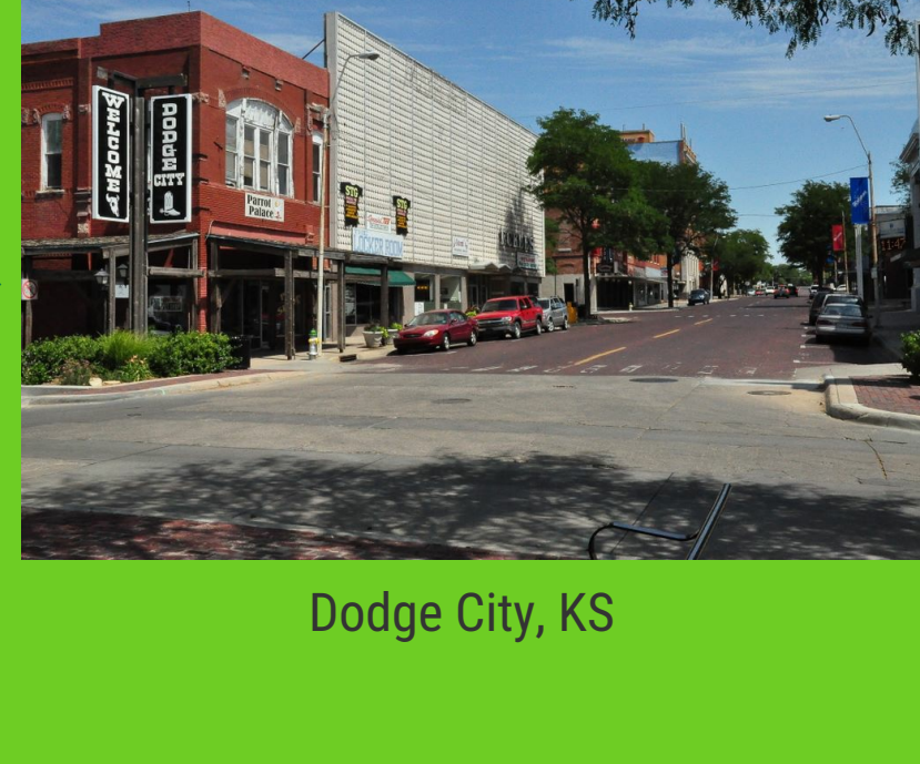
Dodge City, KS