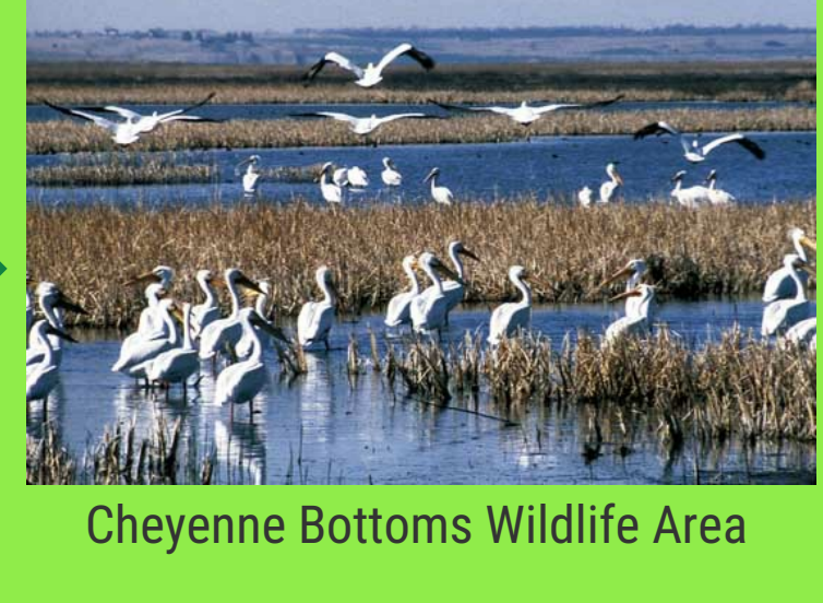
Cheyenne Bottoms Wildlife Area