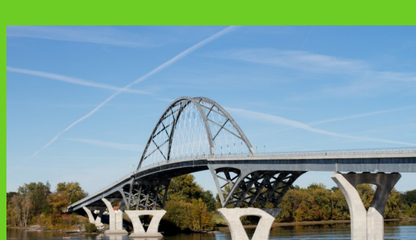
Lake Champlain Bridge