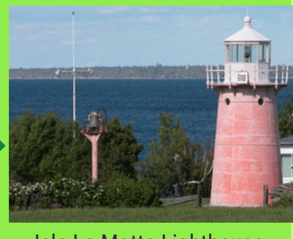
Isle La Motte Lighthouse

From north to south, the route consists of U.S. Route 2 through Grand Isle County, U.S. Route 7 and a portion of U.S. Route 2 in Chittenden County and the communities of Middlebury and Vergennes in Addison County. It includes Vermont's largest city, Burlington, as well as several quintessential New England towns.