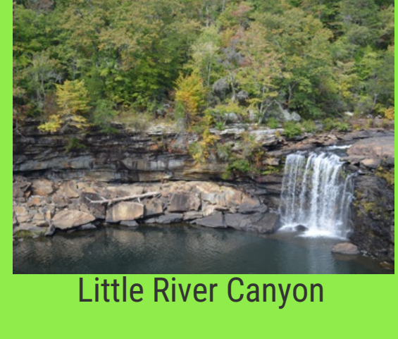
Little River Canyon

The Lookout Mountain Parkway spans three states as it stretches across Lookout Mountain from Gadsden, Alabama to Chattanooga, Tennessee. Within its 93 miles are waterfalls, canyons, scenic vistas, unique towns and villages, state and national parks and preserves, and many more natural wonders.