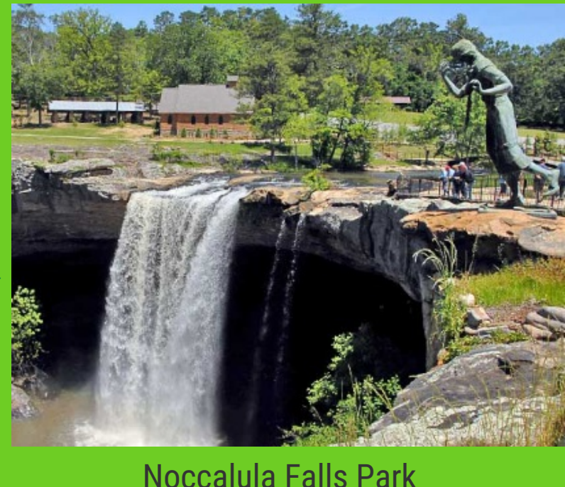
Noccalula Falls Park