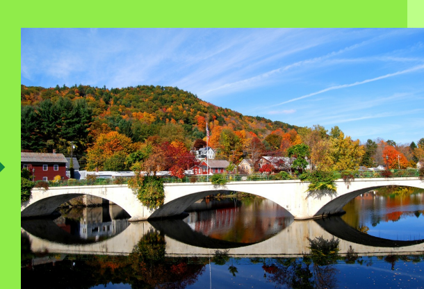
The Bridge of Flowers, Shelburne Falls MA