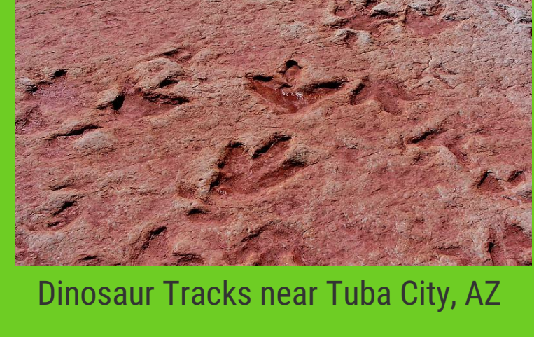
Dinosaur Tracks near Tuba City, AZ