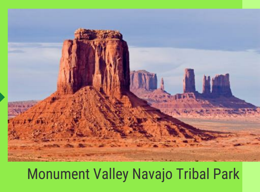
Monument Valley Navajo Tribal Park