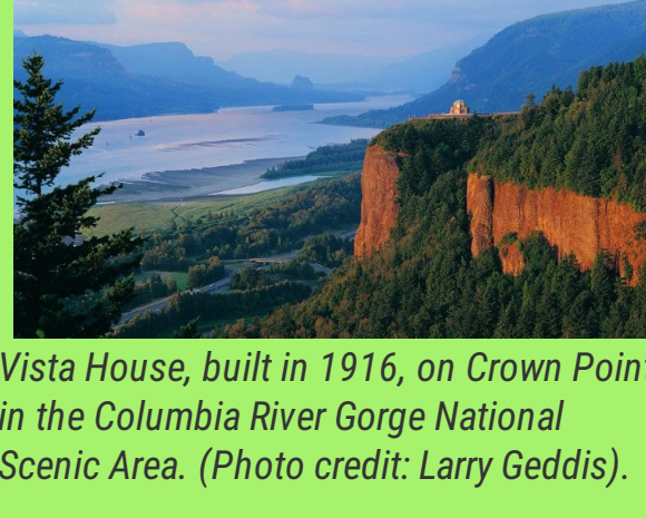
Vista House, built in 1916, on Crown Point in the Columbia River Gorge National Scenic Area. (Photo credit: Larry Geddis).