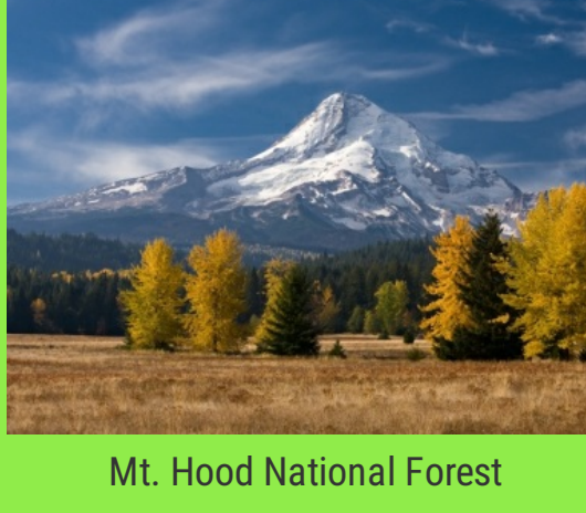
Mt. Hood National Forest