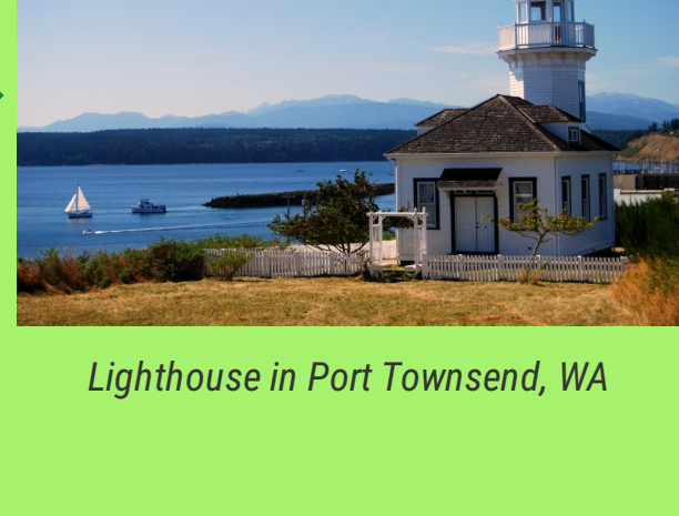
Lighthouse in Port Townsend, WA

Trip Length: Roughly 250 miles, not including side trips