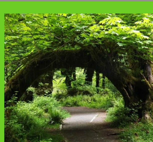
Olympic National Park, WA