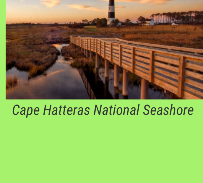
Cape Hatteras National Seashore