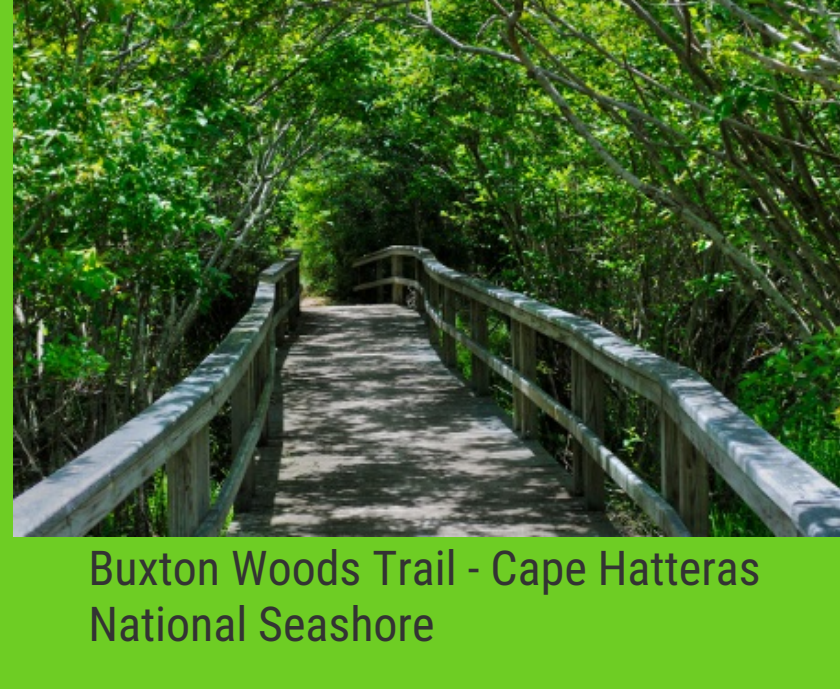
Buxton Woods Trail - Cape Hatteras National Seashore