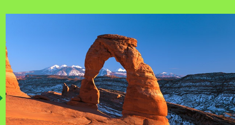
Arches National Park

Passing through twisting canyons, red rock towers, pine forests and pioneer towns, you will experience one of this nation's most beautiful drives. Punctuating the drive are breathtaking panoramas, national parks and monuments, recreation areas and state parks.