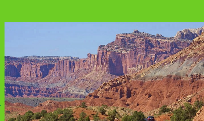
Capitol Reef National Park

Fishlake Scenic Byway: Also part of the designated Fishlake Scenic Byway, is a state highway in the south central portion of the U.S. state of Utah. SR-25 runs from the junction of SR-24 near the town of Koosharem northeast to the west shore of Fish Lake.