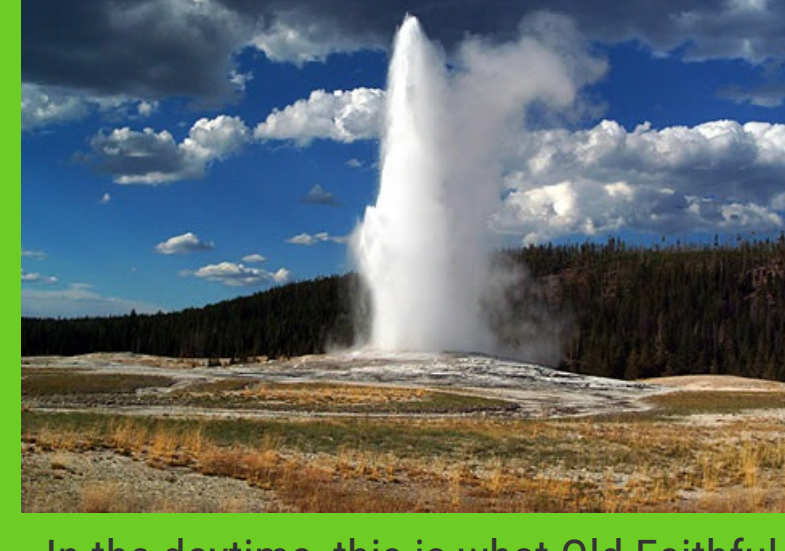
In the daytime, this is what Old Faithful looks like when it erupts.